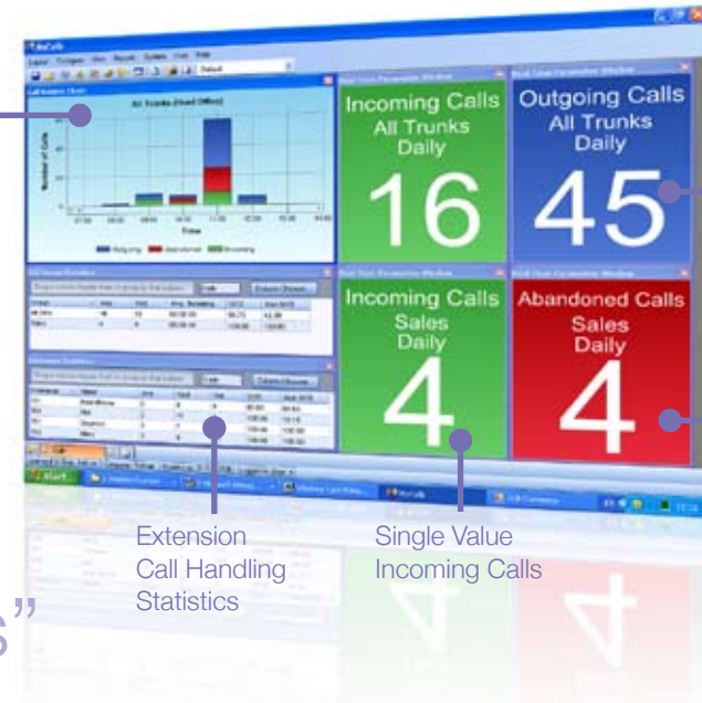
Single Value Outgoing Calls